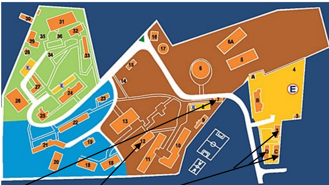
Map of INAOE